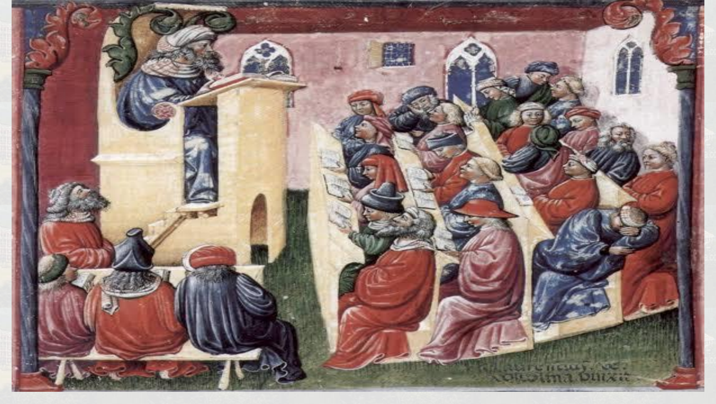
Class room in BC