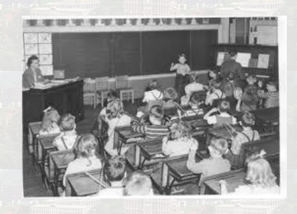
Class rooms 100 years back